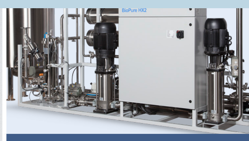
Modular skid system separates for easy installation.