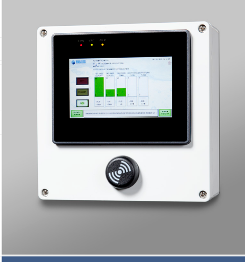
Color-touch screen monitor for patient treatment area.