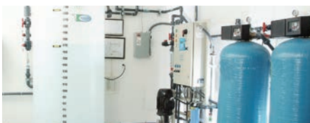
PURICA WATER SYSTEMS

An experienced nationwide team of technicians qualified to work on all types of high purity systems.