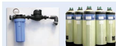
DI-SOLUTION SDI PROGRAM

Streamline the commercial/industrial water procurement process and make water treatment invisible.