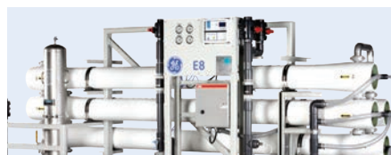
GE E-SERIES RO SYSTEMS

The PURICA™ line is designed to meet almost any cost sensitive water treatment application.