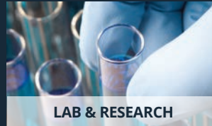
LAB & RESEARCH