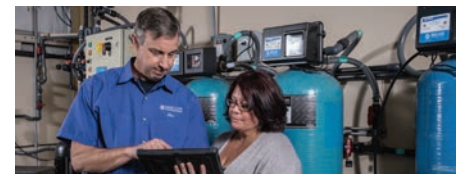
ANNUAL SERVICE PROGRAMS

Convenient service deionization (Service DI) water system rental and service.