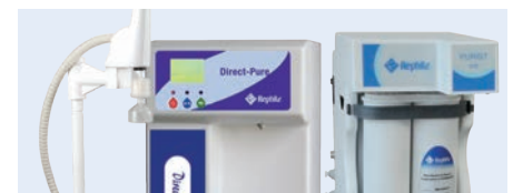
POINT OF USE LAB SYSTEMS

Complete water purification system specifically customized for your facility's requirements.