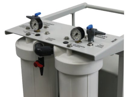
PTG-520 Carbon Filtration System

Dialysis providers have appealed to the water system suppliers to develop an alternative that will ensure chlorine and chloramines are fully and reliably removed prior to the RO in a package that is lighter, not so cumbersome, and cost effective. We investigated carbon block technology and found that specific testing to verify performance for dialysis applications had not been done. This testing is performed to allow safe use of carbon block technology in dialysis applications.