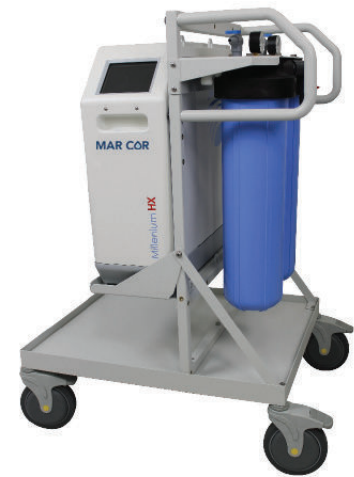
M2 Ergo Cart Design