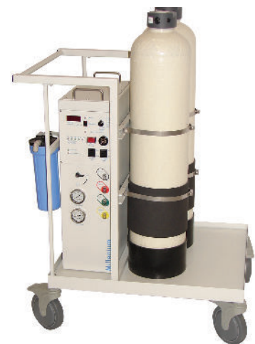
Typical Cart Design