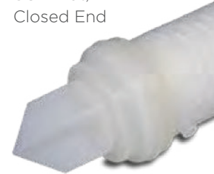
SOE Fin End