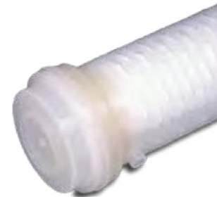
SOE Flat, Closed End