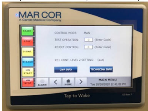
HMI panel X2 base 7 (touch screen)