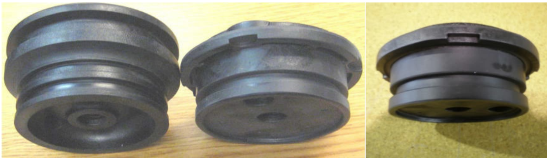
New Style End Cap (From Kit P/N W2T912032)